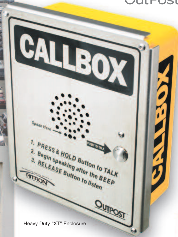
Heavy Duty "XT" Enclosure