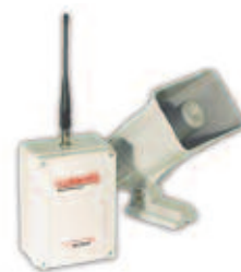
LoudMouth Wireless PA