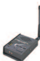
Ritron Base Station