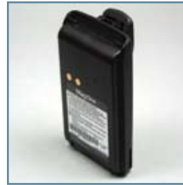
Mag One 1200mAh NiMH Battery PMNN4071_R