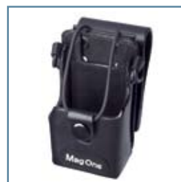
Mag One Hard Leather Case PMLN4742